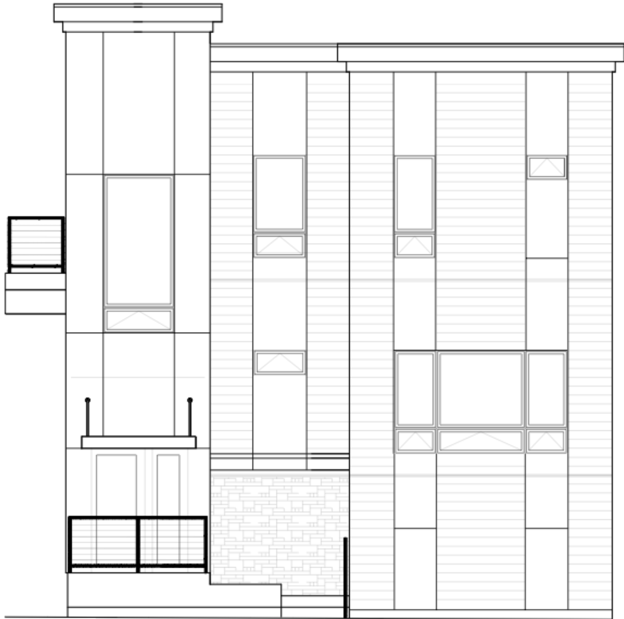
PLAN 2- FRONT ELEVATION