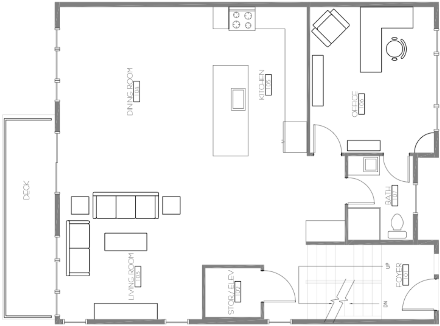
PLAN 2- MAIN LEVEL