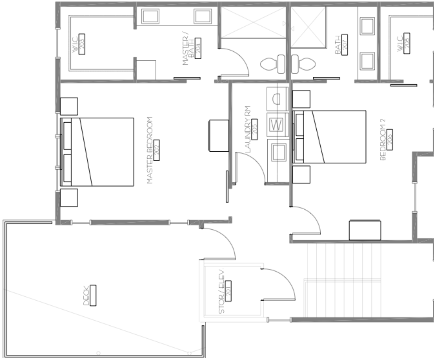
PLAN 2- UPPER LEVEL