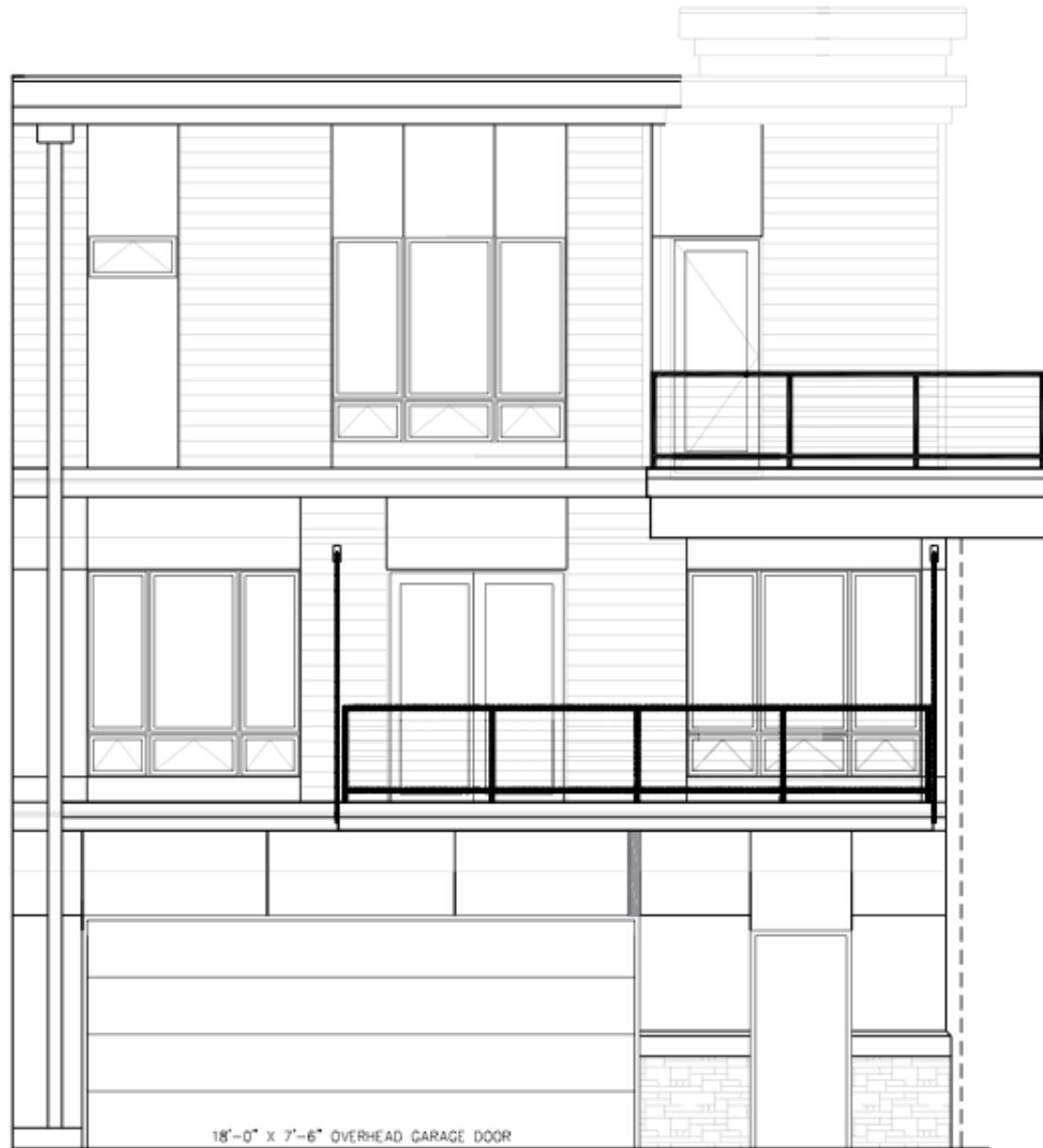
PLAN 2- BACK ELEVATION